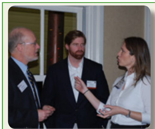
CMAA-SAC Breakfast Meeting